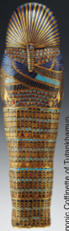
Canopic Coffinette of Tutankhamun

MORE THAN 3000 YEARS AFTER HIS REIGN... THE LOST TREASURES OF A BOY KING COME TO PHILADELPHIA IN A DAZZLING, ONCE-IN-A-LIFETIME EXHIBITION. SEE MORE THAN 130 AMAZING TREASURES BELONGING TO TUT AND HIS ROYAL RELATIVES, MANY NEVER BEFORE SEEN OUTSIDE OF EGYPT.