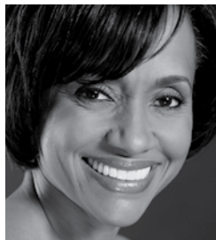
Judge Glenda Hatchett