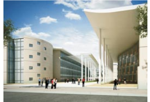
American Community School of Abu Dhabi, Abu Dhabi, UAE LEED Platinum

Sustainability has always been a cornerstone of H2L2’s practice since its founding in 1907 and continues to be today, over a century later.