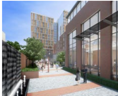
Stamper Square Hotel and Condo, Philadelphia, PA LEED Silver

Following Mayor Nutter’s initiative to make Philadelphia the “greenest” city in the nation, local business leaders have created the Greater Philadelphia Green Business Commitment program to encourage sustainable practices in the workplace. Businesses make a public promise to reduce their negative impact on the environment by following a checklist of practices designed around their typical work day and office setting. This checklist, ranging in topics from water management to leadership and education, provides sustainability guidelines that rank the businesses based on the