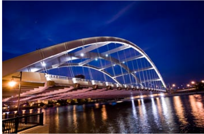
I-480 Western Gateway Project, 2008

H2L2 architects exemplify how to integrate safety, planning and aesthetics into today's infrastructure at International Bridge Conference